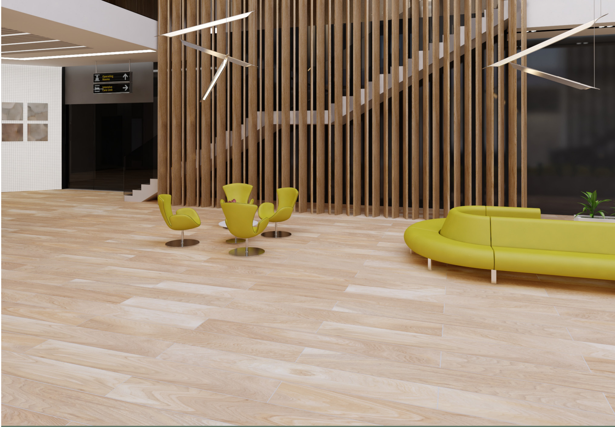
Miami Vanilla 8" x 47"