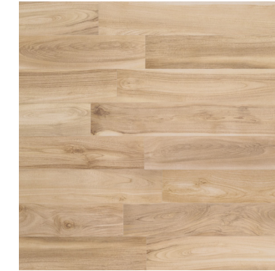
Vanilla | VTL MMVA