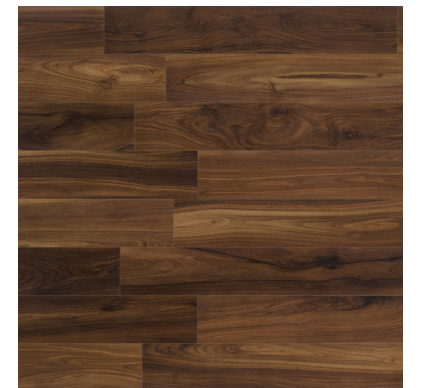
Sand Dune | VTL MMSD