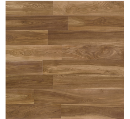
Mocha | VTL MMMO