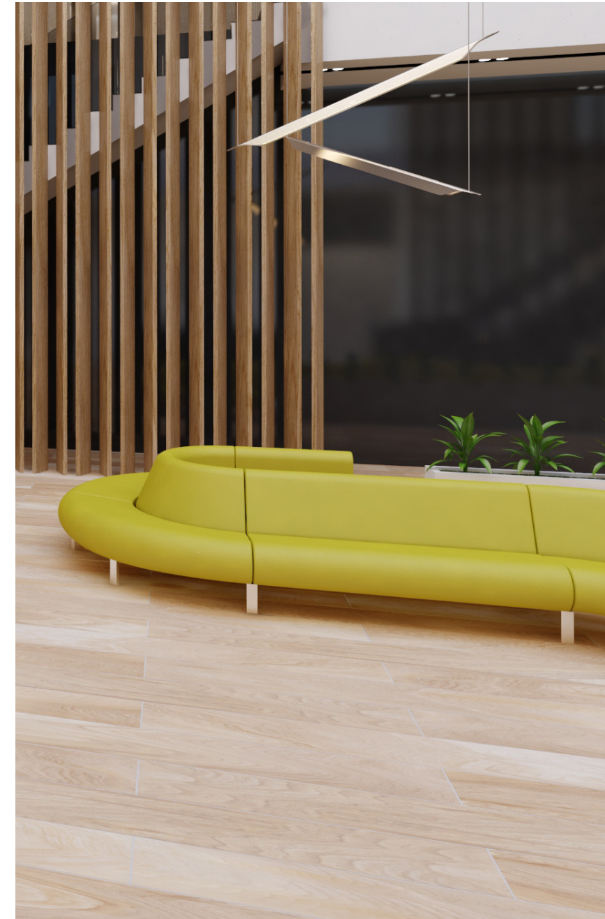
Miami Vanilla 8x47

Whether you're looking for tiles for your home or business, Miami is the perfect option for you.