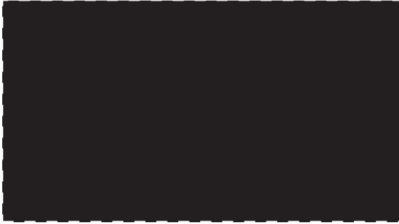
100% to scale