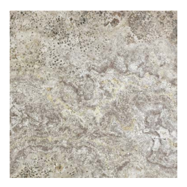
P010A 12x12 P010A 18x18 (not shown) Filled & Honed