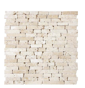
TM526/RSP5/8 Tumbled Random Stack Mosaic