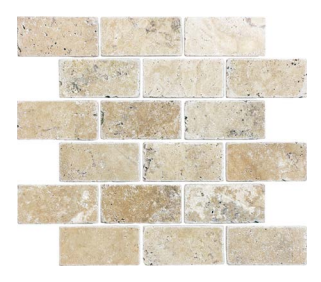
P0444A/2x4 Tumbled Brick Mosaic