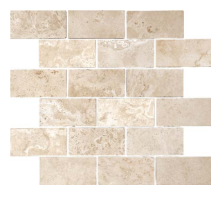
P003A/2x4 Tumbled Brick Mosaic