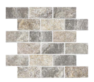
P010A/2x4 Tumbled Brick Mosaic