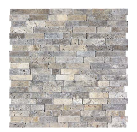
TM586/RSP5/8 Tumbled Random Stack Mosaic