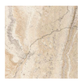
P0444 12x12 P0444A 18x18 (not shown) Filled & Honed