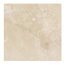
P003 12x12 P003A 18x18 (not shown) Filled & Honed