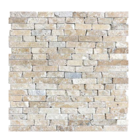
TM546/RSP5/8 Tumbled Random Stack Mosaic