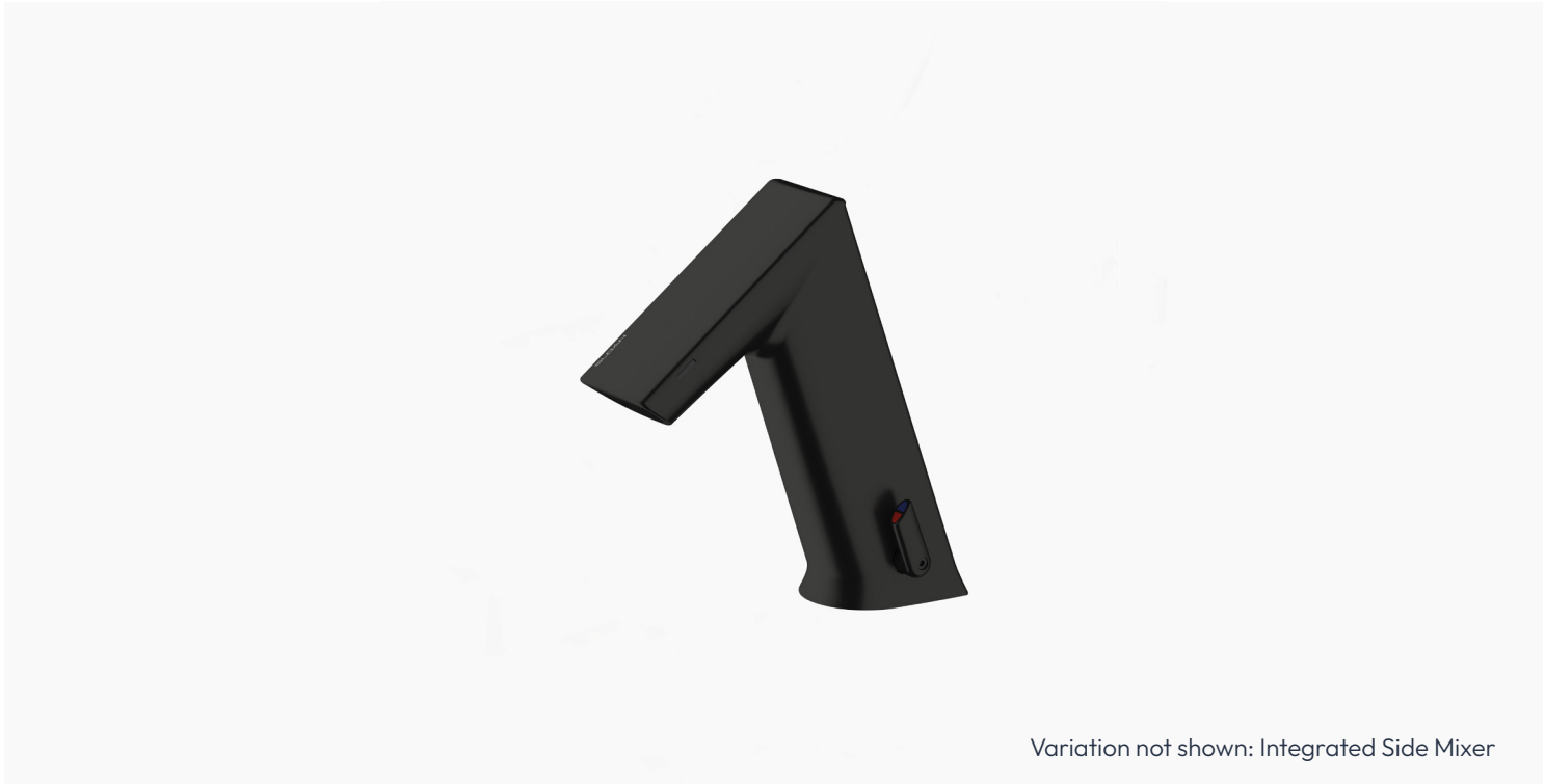
Variation not shown: Integrated Side Mixer