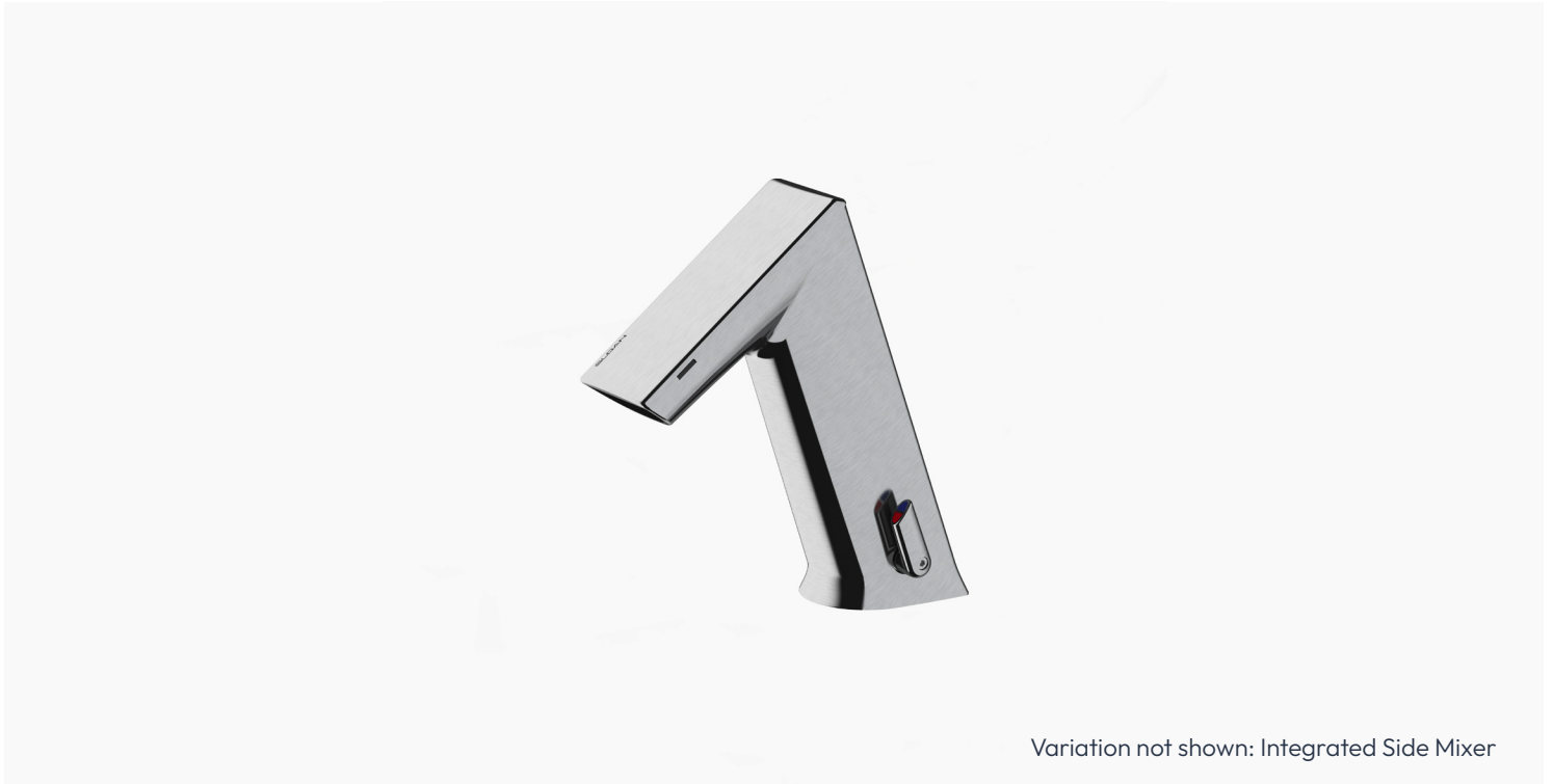
Variation not shown: Integrated Side Mixer