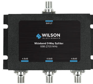
850035 3-Way Splitter