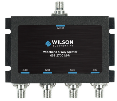
850036 4-Way Splitter