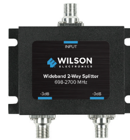
850034 2-Way Splitter