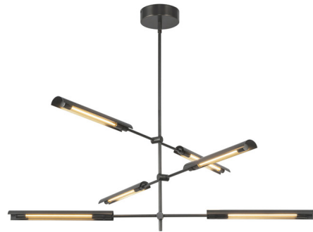
Shown in urban bronze / clear

The Astrid Multi Light Pendant features Metal shades with an Urban Bronze or Vintage Brass finish. Includes 2, 3, or 6 shades, each with an integrated LED light source and a Clear Glass lens. Bars can be twisted to provide uplighting or downlighting. ETL listed.