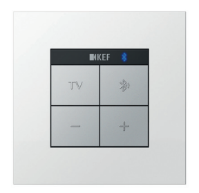
Keypad unit with LED indicators for pairing with compatible devices

BTS30 is not only designed to deliver great sound, but also to be installer friendly and attractive for commercial use. The amplifier and keypad units are connected via RJ45 terminated twisted pair cables, with a maximum length of 20 metres, making positioning in more difficult installations a breeze. With IP64 certified keypad unit, and UL2043 approved amplifier unit allows for installation in bathrooms and air handling spaces respectively. Customers can even decide whether to utilise mono or stereo output, and set a maximum volume.