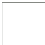
47" x 47" Rectified