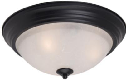
5840ICBK Essentials 1-Light Flush Mount