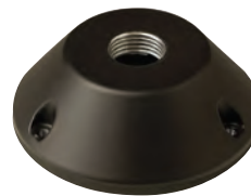
0015 BZ SURFACE MOUNT

Optional mounting accessories for 1536 BZDN (not included): Surface mount, 0015 BZ or tree mount, 0021 BZ