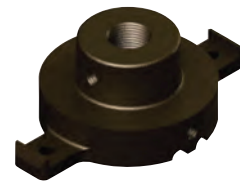
0021 BZ TREE MOUNT