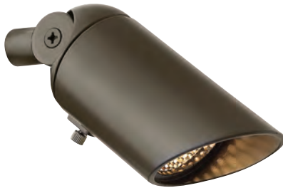
1536 BZDN MR16 DOWN LIGHT 2 1/2" DIA. SHROUD 5 3/4" W x 3 1/4" H

DESIGN NOTE | 1536 BZDN is down light only