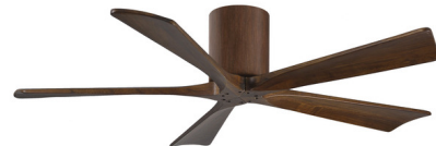
Shown in walnut / walnut tone