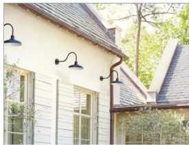
FORGE™ Inspired by a lighting industry staple barn light, Forge features a practical outdoor lighting solution to withstand the elements. Forge is built to last with an industrial chic flair. Part of the Coastal Elements Collection, Forge is available in a variety of anti-fading finishes that are resistant to rust and corrosion with a 5-year warranty.