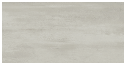
Beige | VTL AYBE