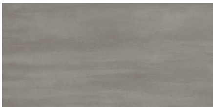
Taupe | VTL AYTA