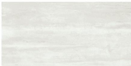
White | VTL AYWH