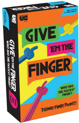
GIVE 'EM THE FINGER Ages 8 and Up 3 or More Players