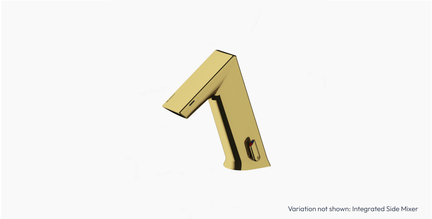
Variation not shown: Integrated Side Mixer