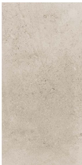
29615 12x24 Roman Gray