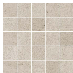
29615/M12 Roman Gray Mosaic