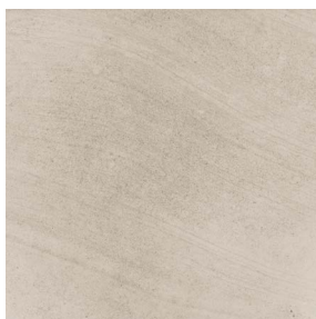
29615 12x12 Roman Gray