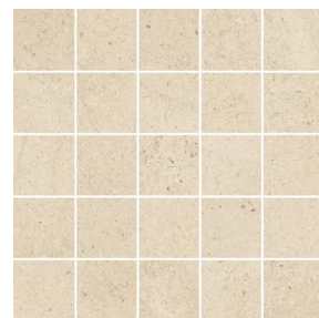
29622/M12 Porto Cream Mosaic