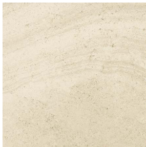
29622 12x12 Porto Cream