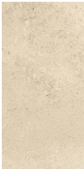
29622 12x24 Porto Cream