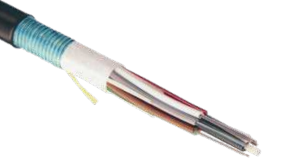
Fortex™ DT Light Armor Loose Tube Fiber Optic Cable

Lose the Gel with Durable, Totally Gel-Free Fiber Optic Cable for Cleaner, Faster Installations