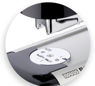
Adjustable anvil rotates for more stapling options.