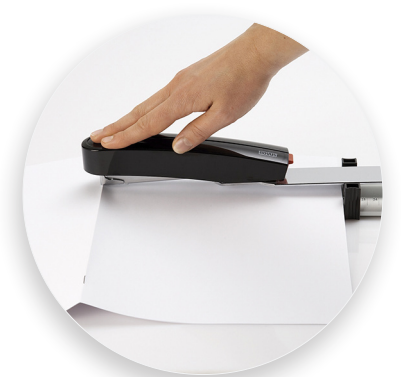
11.75" throat depth for saddle stitching booklets and large documents.