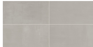
Breeze AOT SS37