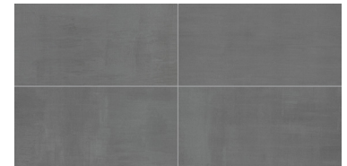
Stone AOT SS38