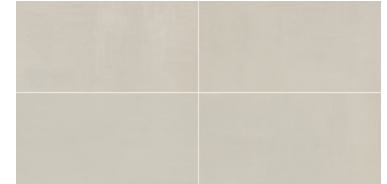
Dune AOT SS36