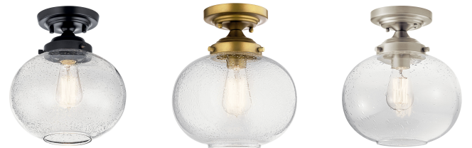
42296BK 42296NBR 42296NI