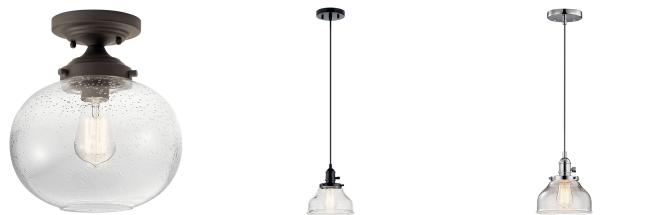
42296OZ 43850BK 43850CH