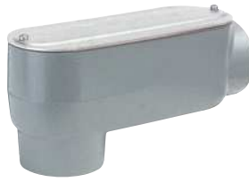
SOLB-8, 9, 0