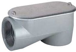
SLB-1 thru 7