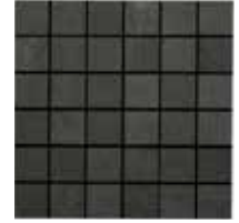
NVM06.10202MOS Graphite Black 2 x 2 Mosaic