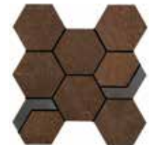
NVM04.1HEXIMOS Copper Deposit with Iron Mixed Hex Mosaic