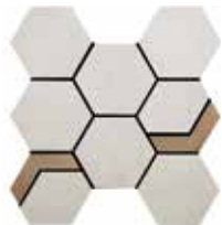
NVM01.1HEXGMOS Noble Platinum with Gold Mixed Hex Mosaic