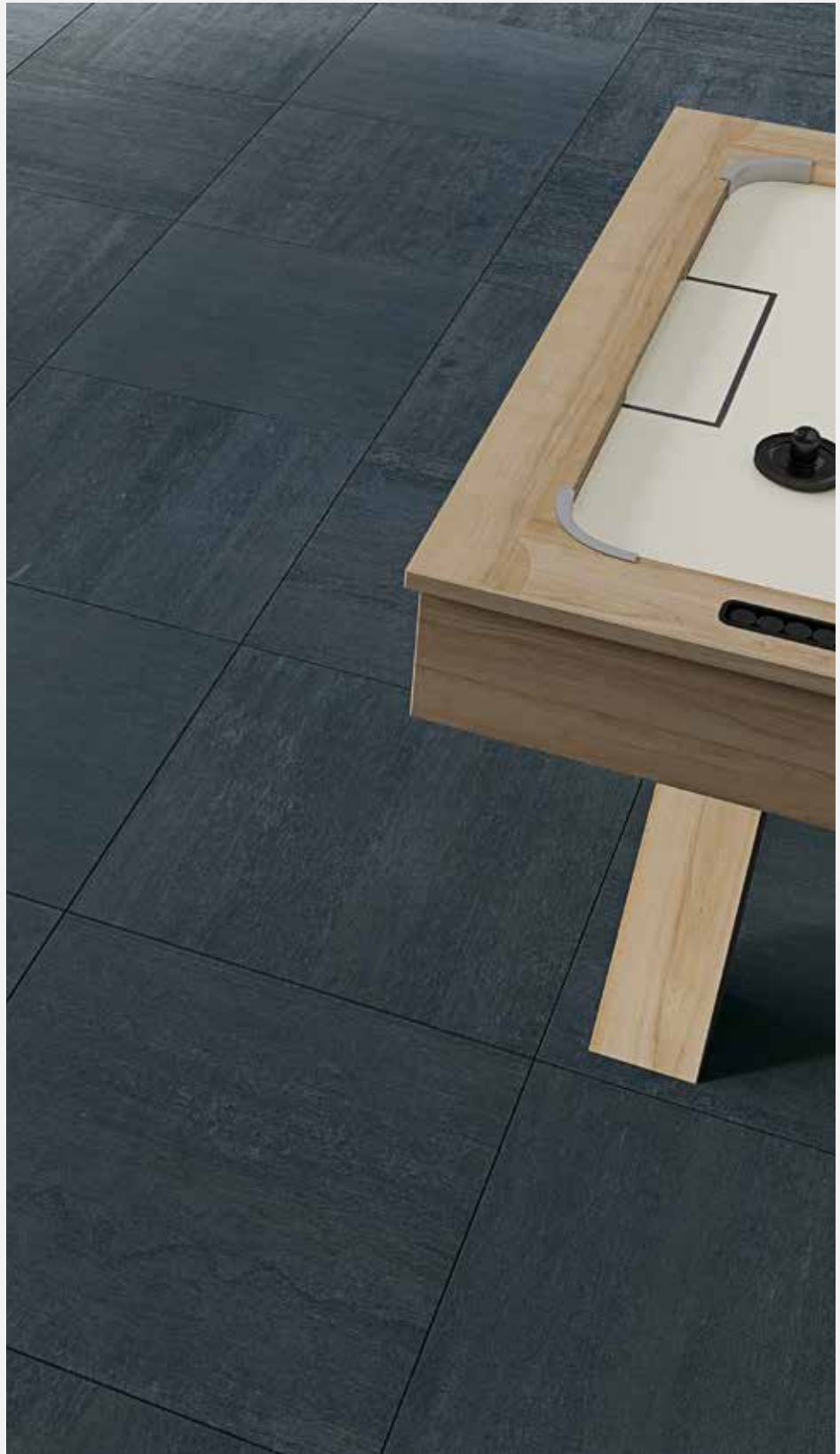
NVM05 ▶ Cobalt Ore 24x24