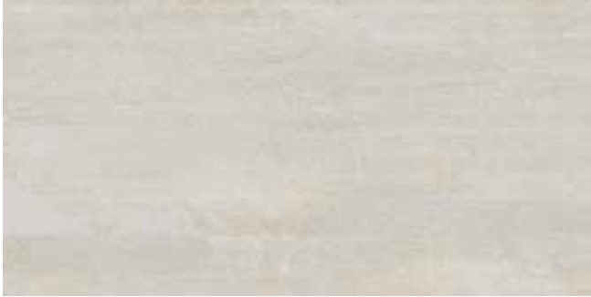
NVM01 ▶ Noble Platinum