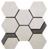
NVM01.1HEXIMOS Noble Platinum with Iron Mixed Hex Mosaic