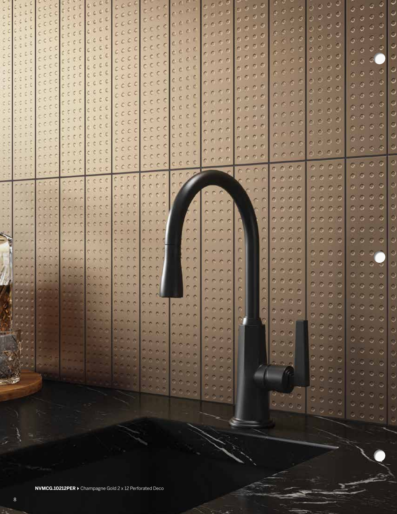
NVMCG.10212PER ▶ Champagne Gold 2 x 12 Perforated Deco