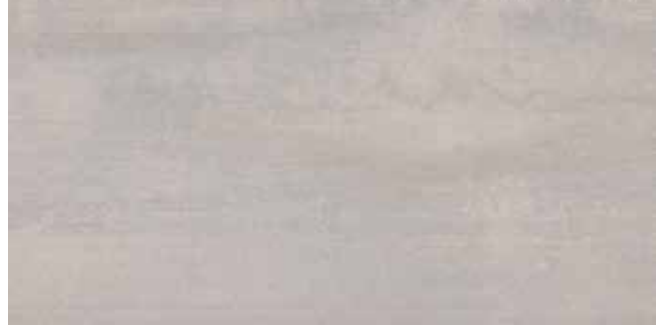
NVM02 ▶ Nickel Plate