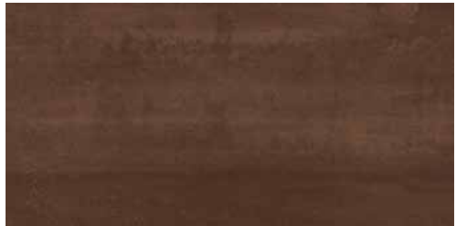
NVM04 ▶ Copper Deposit