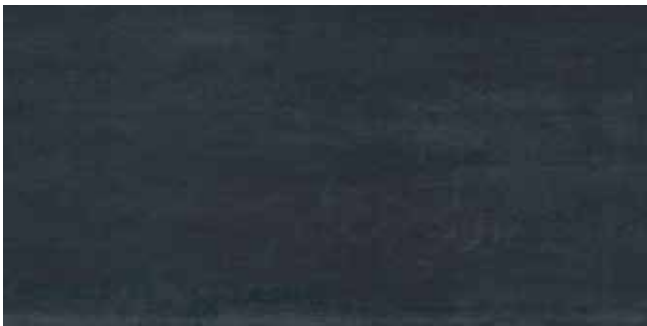
NVM05 ▶ Cobalt Ore