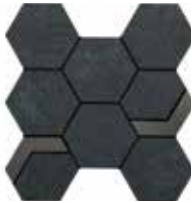
NVM05.1HEXIMOS Cobalt Ore with Iron Mixed Hex Mosaic