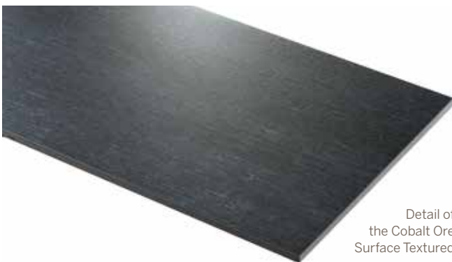
Detail of the Cobalt Ore Surface Textured