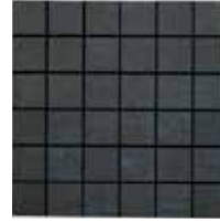
NVM05.10202MOS Cobalt Ore 2 x 2 Mosaic