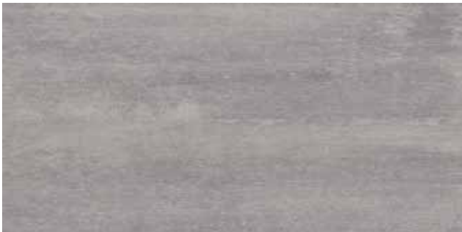
NVM03 ▶ Crucible Steel