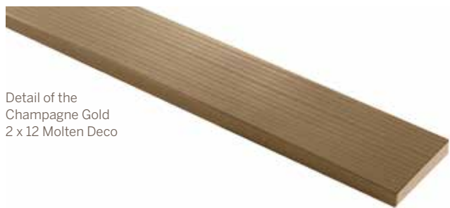
Detail of the Champagne Gold 2 x 12 Molten Deco