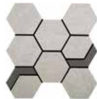
NVM02.1HEXIMOS Nickel Plate with Iron Mixed Hex Mosaic