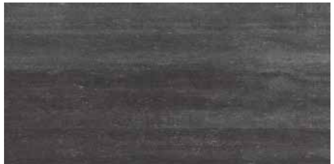
NVM06 ▶ Graphite Black