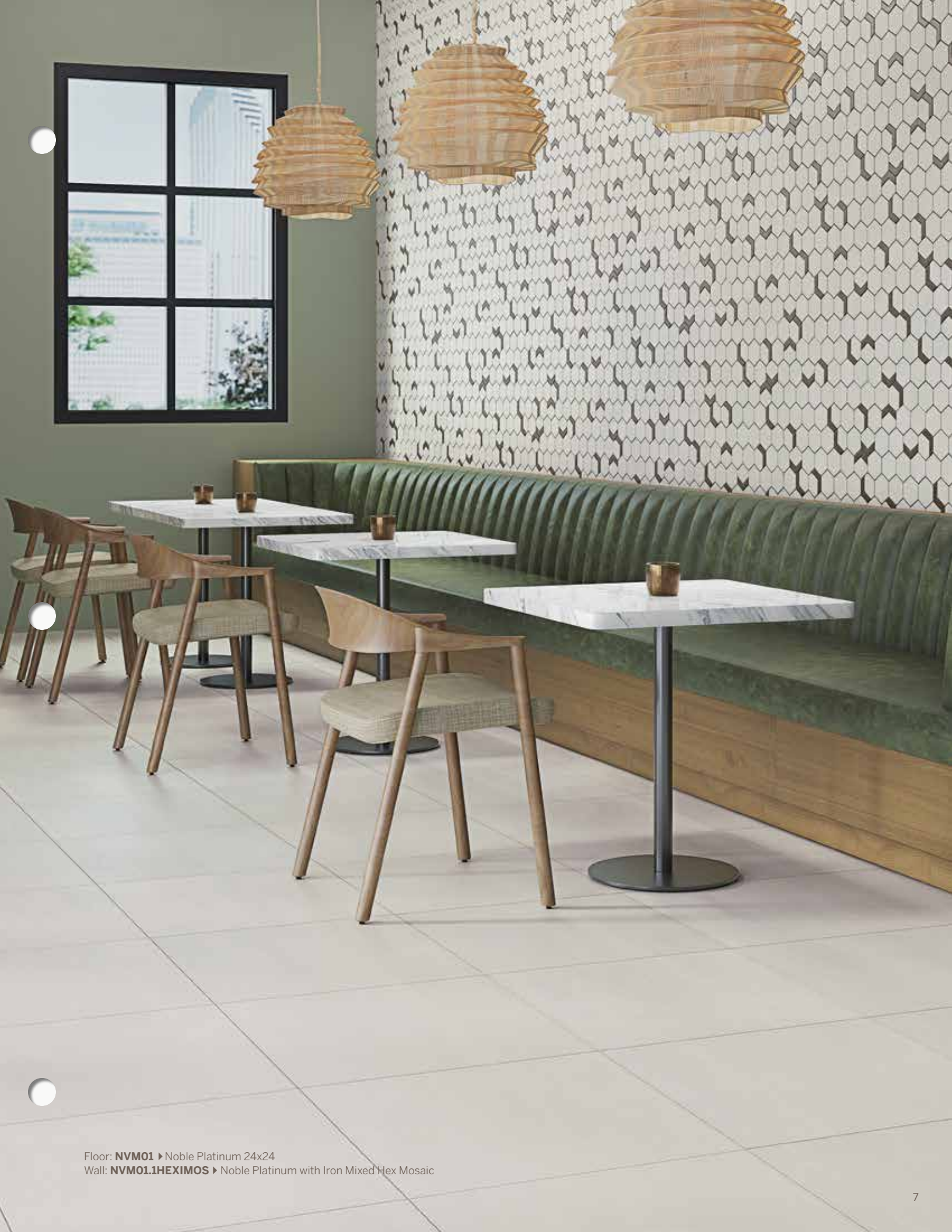
Floor: NVM01 ▶ Noble Platinum 24x24 Wall: NVM01.1HEXIMOS ▶ Noble Platinum with Iron Mixed Hex Mosaic