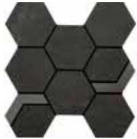
NVM06.1HEXIMOS Graphite Black with Iron Mixed Hex Mosaic