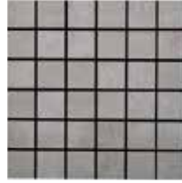
NVM03.10202MOS Crucible Steel 2 x 2 Mosaic