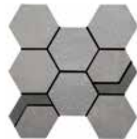
NVM03.1HEXIMOS Crucible Steel with Iron Mixed Hex Mosaic