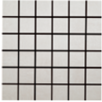
NVM01.10202MOS Noble Platinum 2 x 2 Mosaic