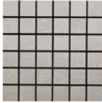
NVM02.10202MOS Nickel Plate 2 x 2 Mosaic