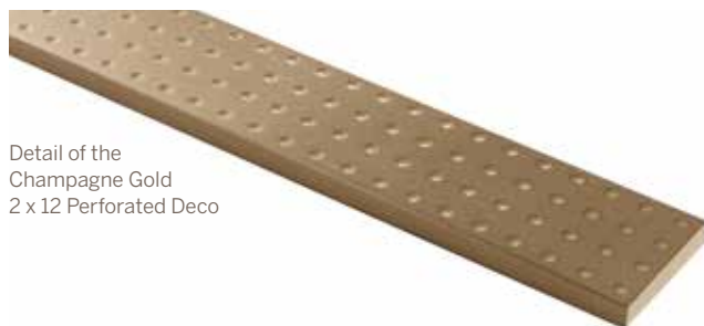
Detail of the Champagne Gold 2 x 12 Perforated Deco