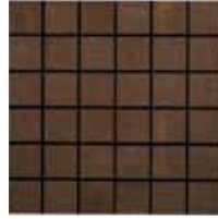
NVM04.10202MOS Copper Deposit 2 x 2 Mosaic