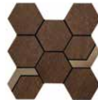
NVM04.1HEXGMOS Copper Deposit with Gold Mixed Hex Mosaic