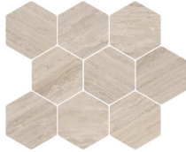
In Cream CER ICIC HEX