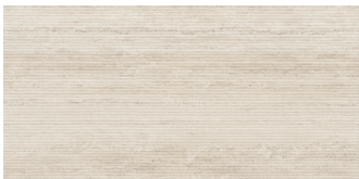
In Ivory CER ICII LINES