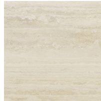
In Cream CER ICIC