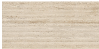
In Cream CER ICIC LINES