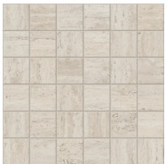
In Ivory CER ICII MOS22