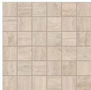
In Cream CER ICIC MOS22