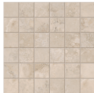
Contro Cream CER ICCC MOS22