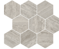
In Grey CER ICIG HEX