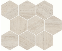
In Ivory CER ICII HEX