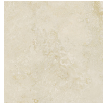
Contro Cream CER ICCC