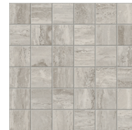
In Grey CER ICIG MOS22