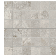
Contro Grey CER ICCG MOS22