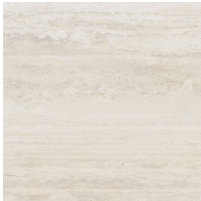
In Ivory CER ICII