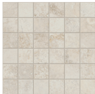
Contro Ivory CER ICCI MOS22