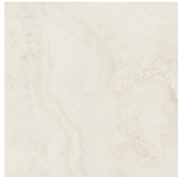
Contro Ivory CER ICCI