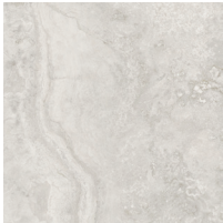
Contro Grey CER ICCG