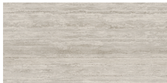
In Grey CER ICIG LINES