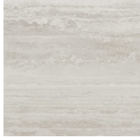
In Grey CER ICIG