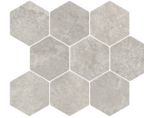
Contro Grey CER ICCG HEX