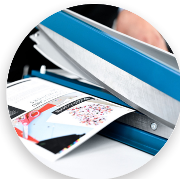
Self-sharpening system maintains a perfectly honed blade.