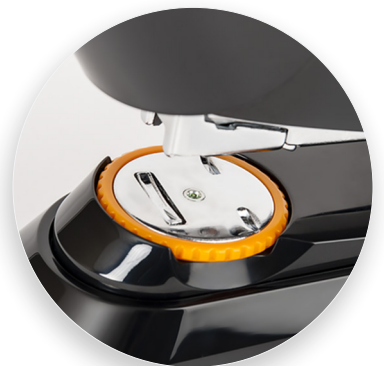
Adjustable anvil rotates for more stapling options.