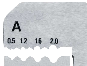
12 11 180: wire cross-sections in inches