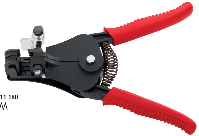
12 11 180 MM