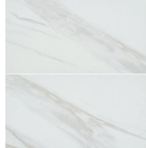
Oro | CTI MLOR