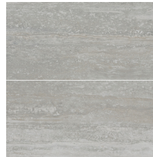
Travertine | CTI MLTR