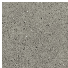
Dark Gray VTL EVDG