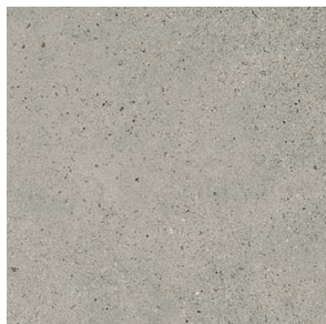
Light Gray VTL EVLG