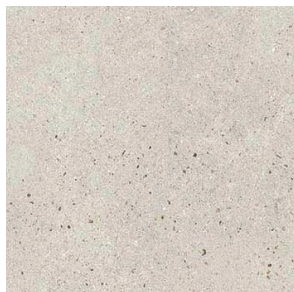
White VTL EVWH