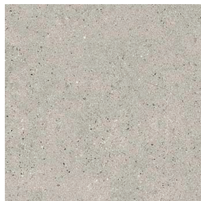
Beige VTL EVBG