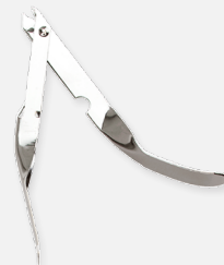
SKIN STAPLE REMOVER