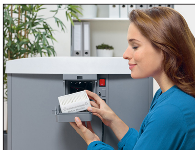
The CleanTEC® filter traps up to 98% of the fine dust and provides a healthier work environment.