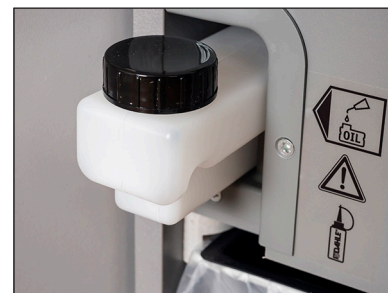
The EvenFlow Lubricator provides continuous lubrication and ensures peak performance.