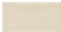
Beachcomber CTI SNBE