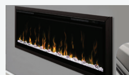
Ignite XL Trim Kit