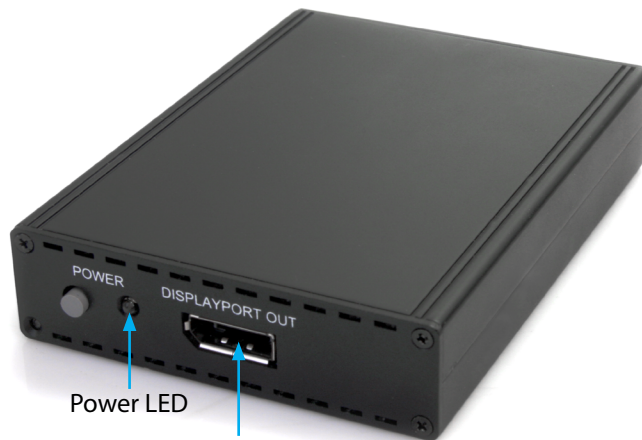
Power LED DisplayPort connector (output)