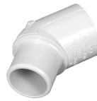
Part No. CTS 2310 Street Elbow 45° (SPG x S)