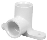
Part No. CTS 2300 D Drop Ear Elbow (ALL-CPVC SOCKET x SOCKET)