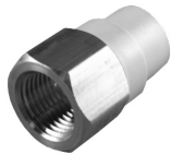
Part No. CTS 2105 L Low-Lead Female Adapter, Brass Threads (BRASS FPT x CTS SOCKET)

Note: Different discount may apply to brass items. Please contact sales office.