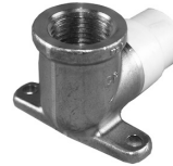
Part No. CTS 2302 L Low-Lead CPVC/Brass Drop Ear Elbow 90° (BRASS FPT x CTS SOCKET)

All products manufactured by Charlotte Pipe and Foundry Company are proudly made in the U.S.A.