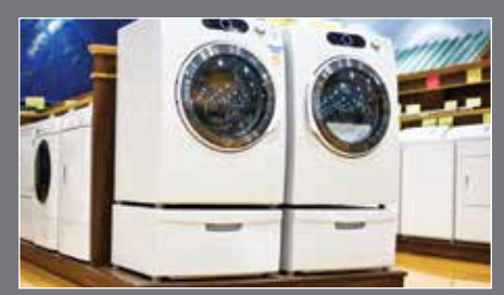
Wholesale Clubs Hospitals Specialty Ret