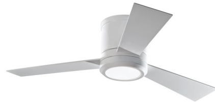
Shown in matte white / matte white / matte white

COLOR RENDERING . . . . . 90 CRI LAMP COLOR . . . . . 2700K LUMENS/WATT . . . . . 47.50 LUMINOUS FLUX . . . . . 950 lumens