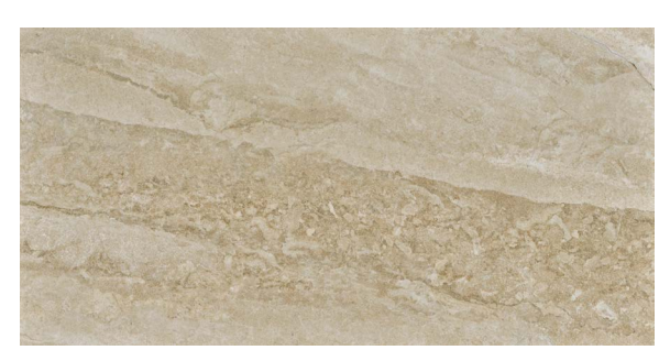
28434 12x24 Soft Rock