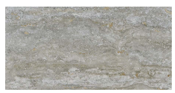
28460 12x24 Dry Stream