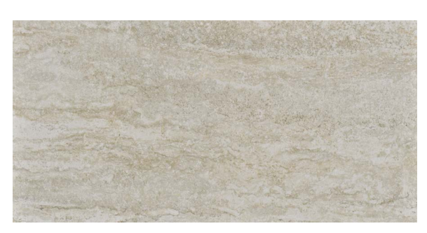
28430 12x24 Warm Winter Mix