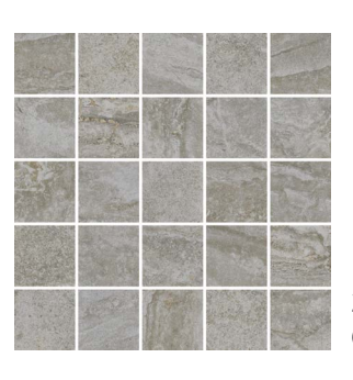
28412/M12 Cool Summer Mix Mosaic