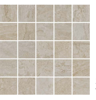
28430/M12 Warm Winter Mix Mosaic