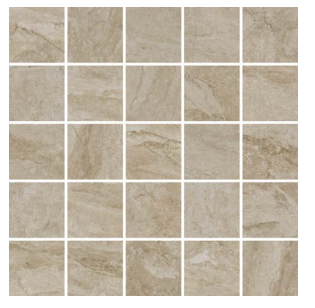
28434/M12 Soft Rock Mosaic