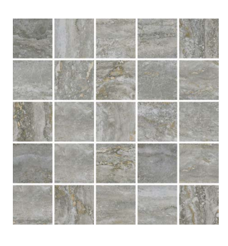
28460/M12 Dry Stream Mix Mosaic