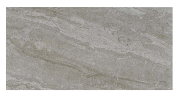
28412 12x24 Cool Summer Mix