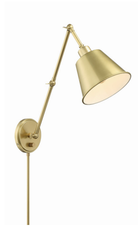
Shown in aged brass

The Mitchell Wall Sconce flawlessly combines form and function. With an extendable arm, the Mitchell works well for task lighting in transitional spaces. Place it on the bedside for nighttime reading or in the office for focused lighting. On/off dimming switch located on the back-plate. Available in two sizes and finished in Aged Brass, Matte Black, or Polished Nickel. UL and CSA rated.