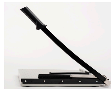
A tension spring returns the blade to the up position after trimming to reduce fatigue.