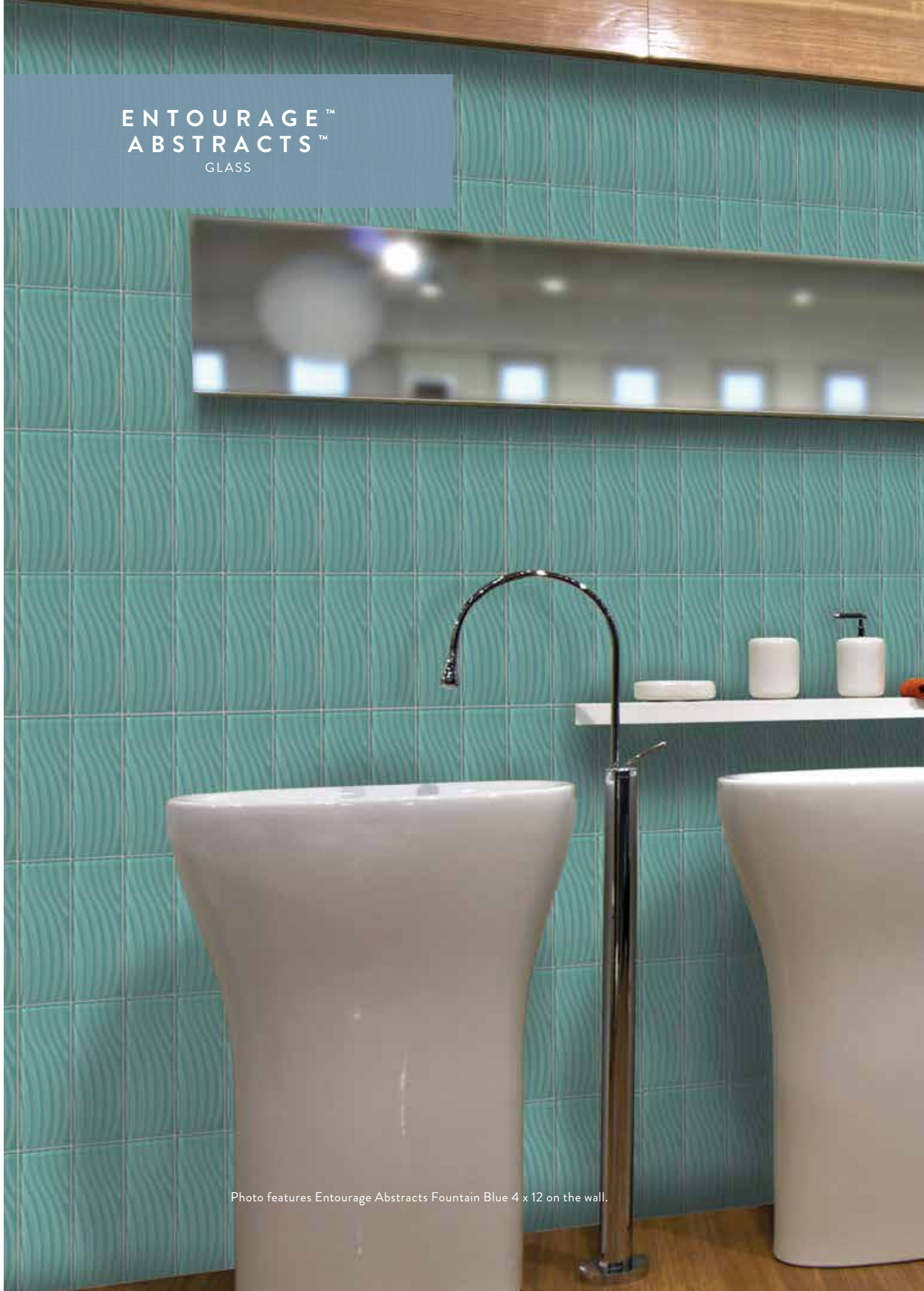
Photo features Entourage Abstracts Fountain Blue 4 x 12 on the wall.