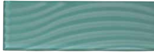
FOUNTAIN BLUE C108