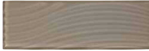
PLAZA TAUPE C105