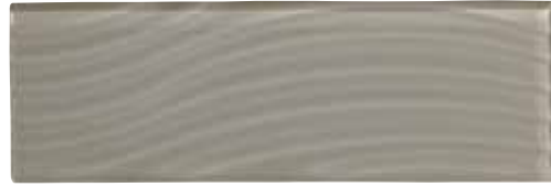
SILVER CLOUD C102