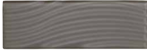
CHARCOAL GRAY C121