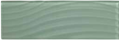
VINTAGE MINT C107