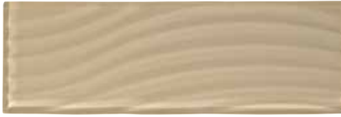
CLOUD CREAM C104