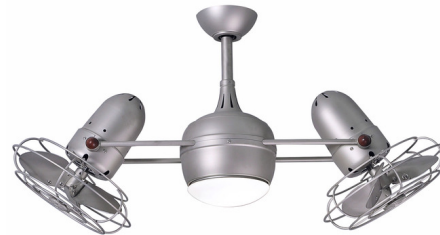
Shown in brushed nickel / brushed nickel