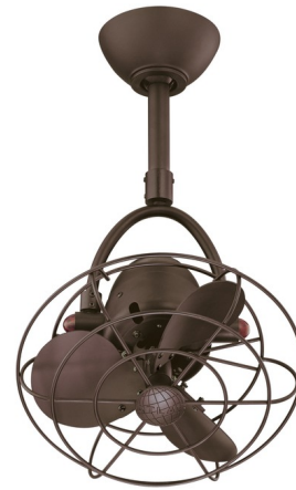
Shown in textured bronze