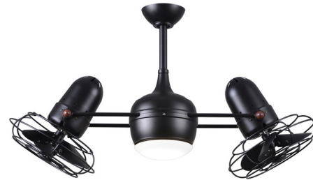
Shown in matte black / matte black