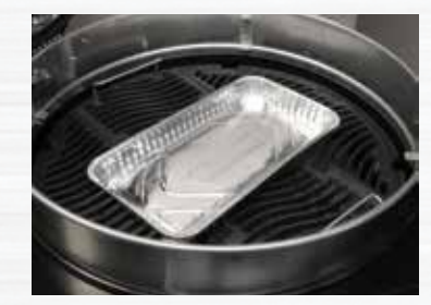
Large Drip Trays