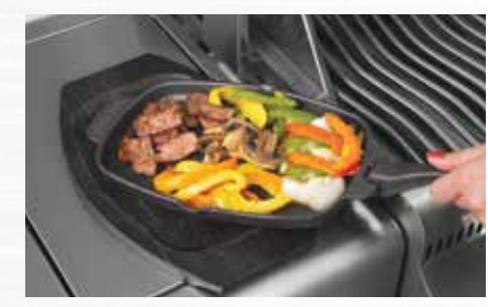
Cast Iron Sizzle Platter