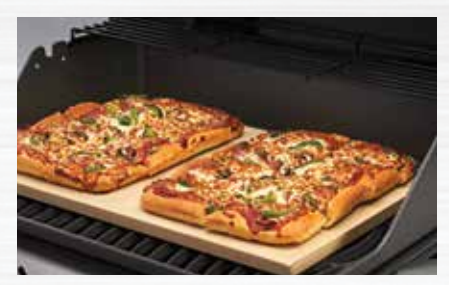
Rectangular Baking Stone