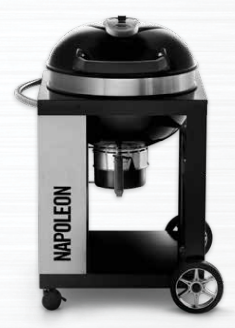
PRO CHARCOAL CART