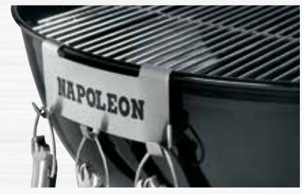
Charcoal Kettle Tool Hanger