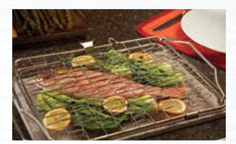
Healthy Choice Starter Kit