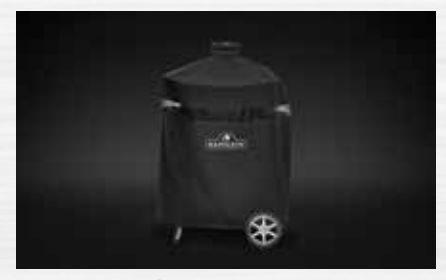
Kettle Leg Grill Cover