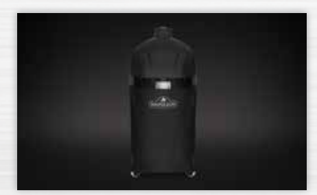
AS300K Apollo<sup>®</sup> Grill Cover