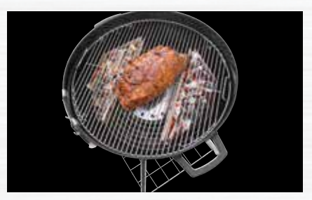
Charcoal Baskets 67400