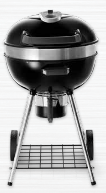
PRO CHARCOAL LEG