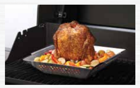
Chicken Roaster & Wok