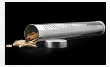
Wood Chip Starter Kit 67020