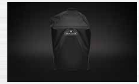
Kettle Cart Cover