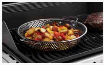
Stainless Steel Grilling Wok