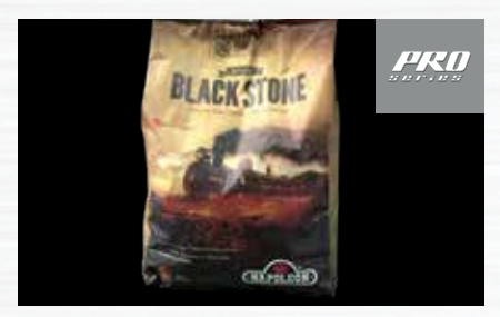
Blackstone Premium Charcoal