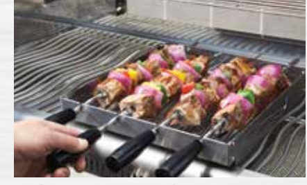
Stainless Steel Rotating Skewer Rack