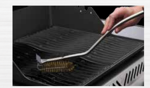
Super WAVE Grill Brush 62013