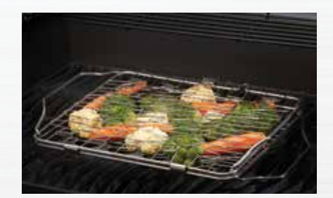
Flexible Grill Basket 57012