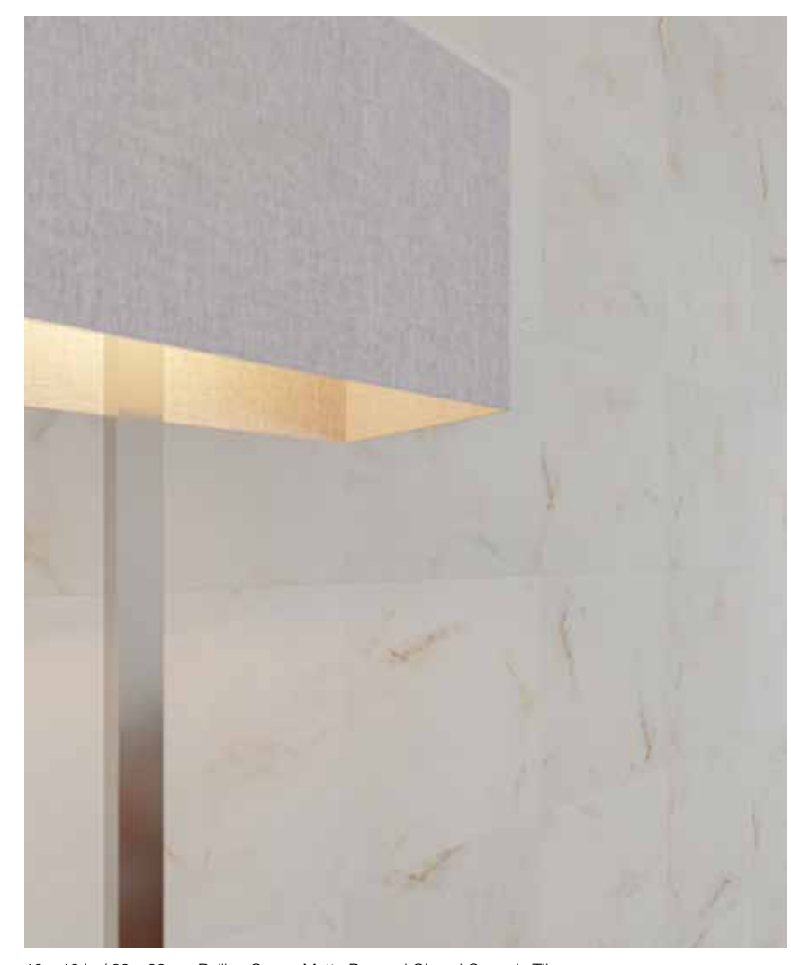
13 x 13 in / 33 x 33 cm Bellina Cream Matte Pressed Glazed Ceramic Tile