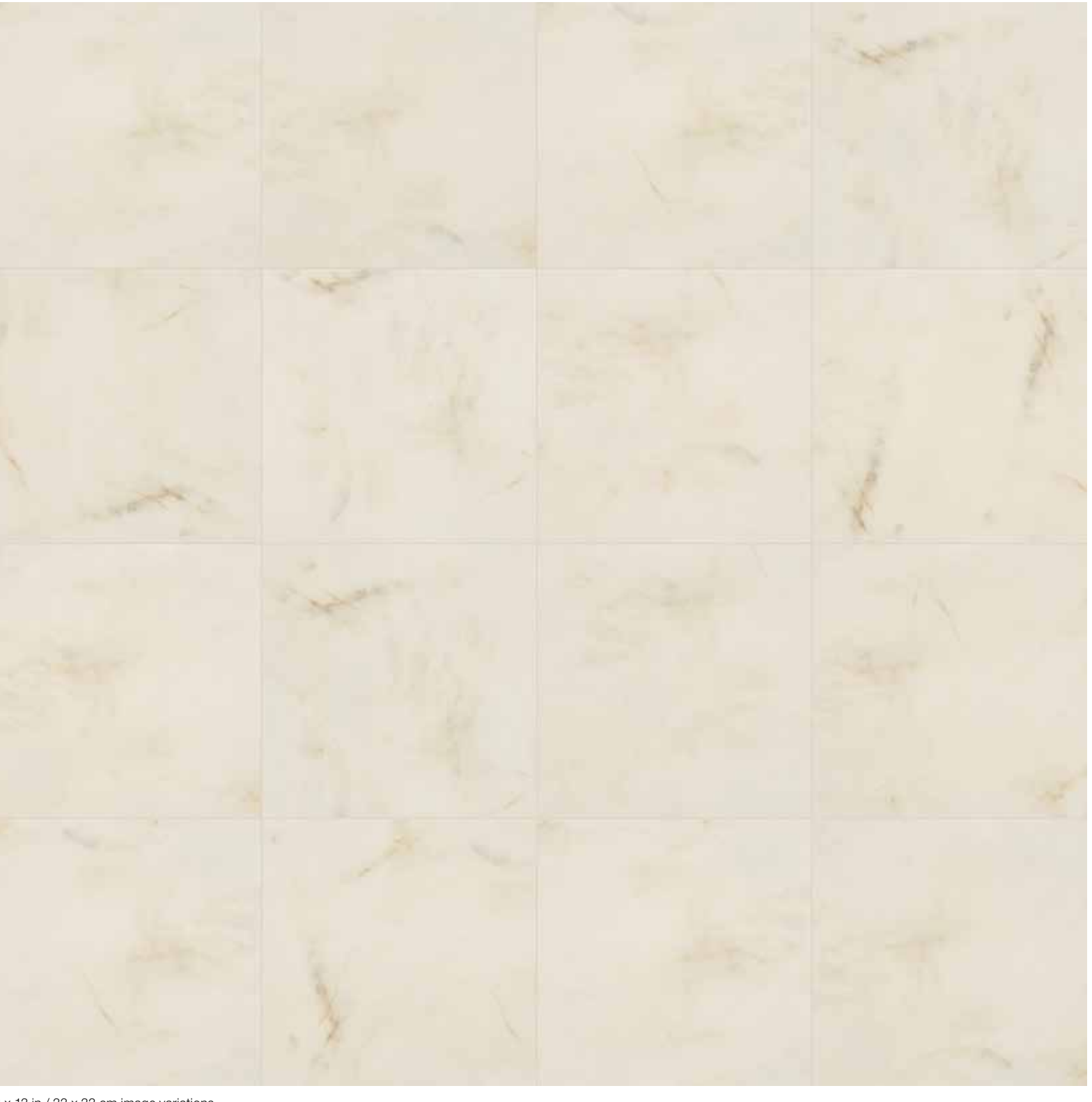
13 x 13 in / 33 x 33 cm image variations