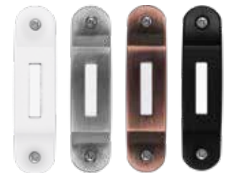
White Nickel Copper Black