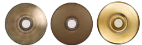
Antique Brass Architectural Bronze Polished Brass