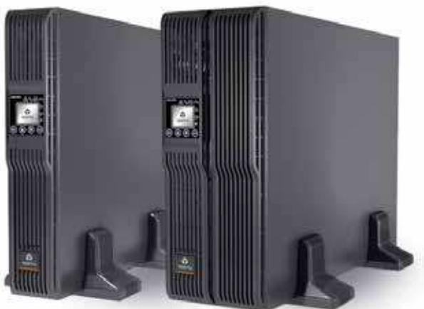
Liebert GXT4 700 - 3000 VA