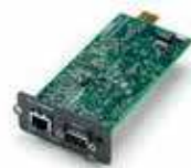
Vertiv™ IntelliSlot® Communication Card