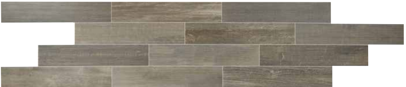
PATINA GRAY TB18