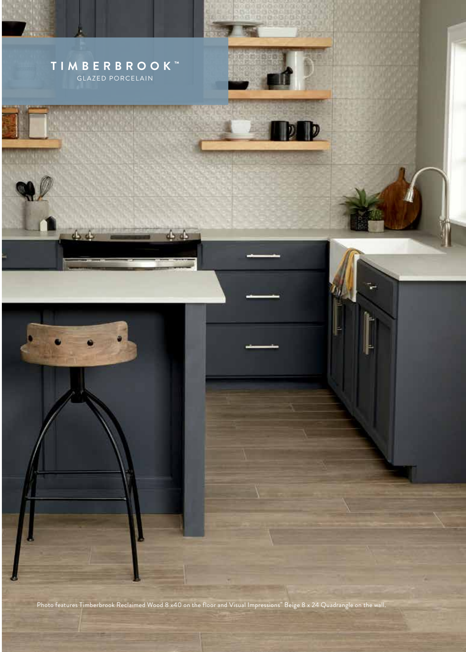
Photo features Timberbrook Reclaimed Wood 8 x40 on the floor and Visual Impressions™ Beige 8 x 24 Quadrangle on the wall.