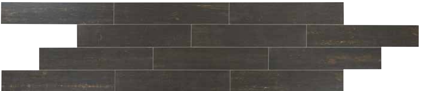
BARN LOFT TB17