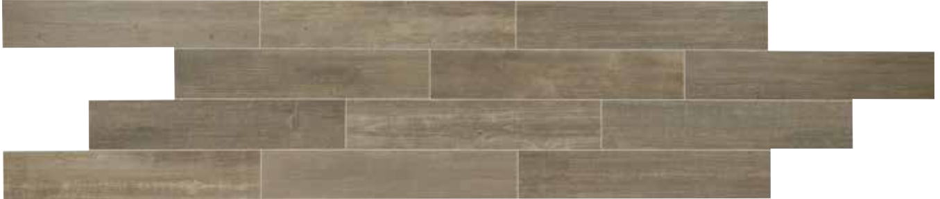
RECLAIMED WOOD TB15