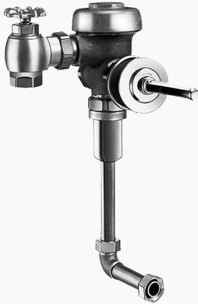
Variation Not Shown: Metal Index Push Button